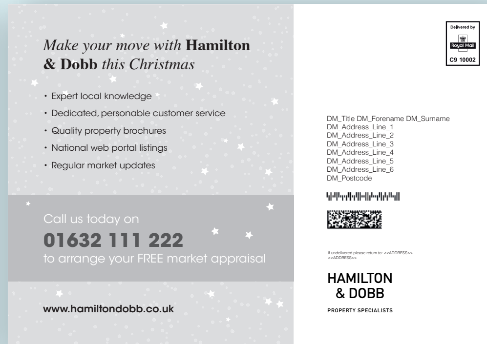
BEST GIFT THIS CHRISTMAS (DESIGN 2b)