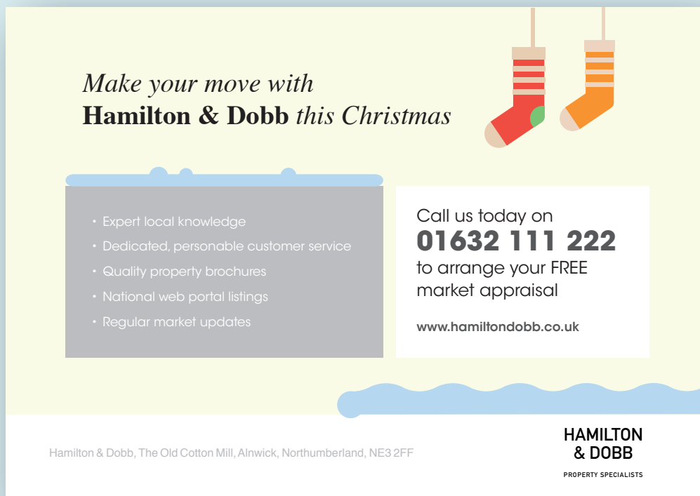
BEST GIFT THIS CHRISTMAS (DESIGN 1a)