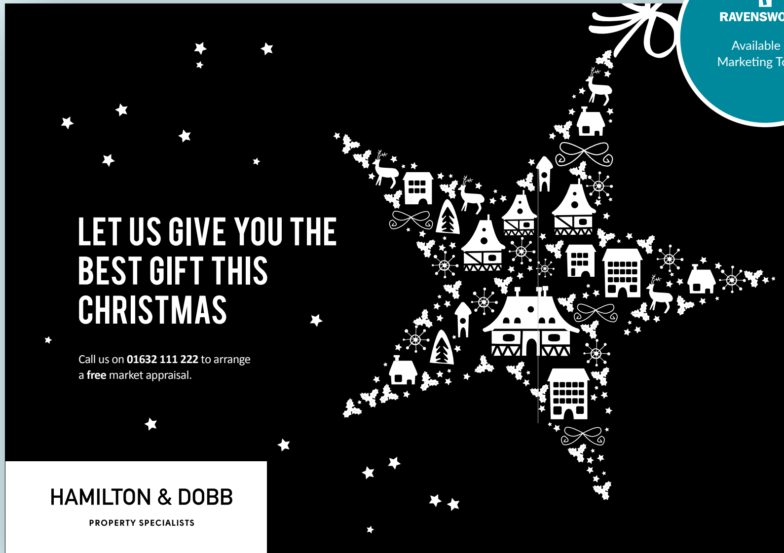
BEST GIFT THIS CHRISTMAS (DESIGN 2)