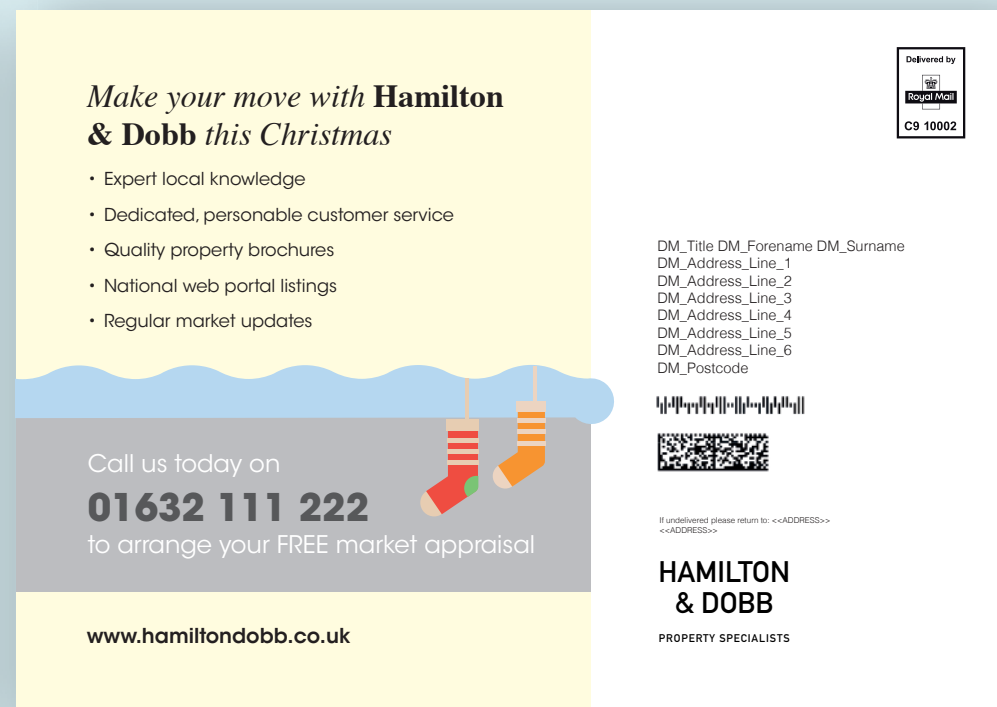
BEST GIFT THIS CHRISTMAS (DESIGN 1b)