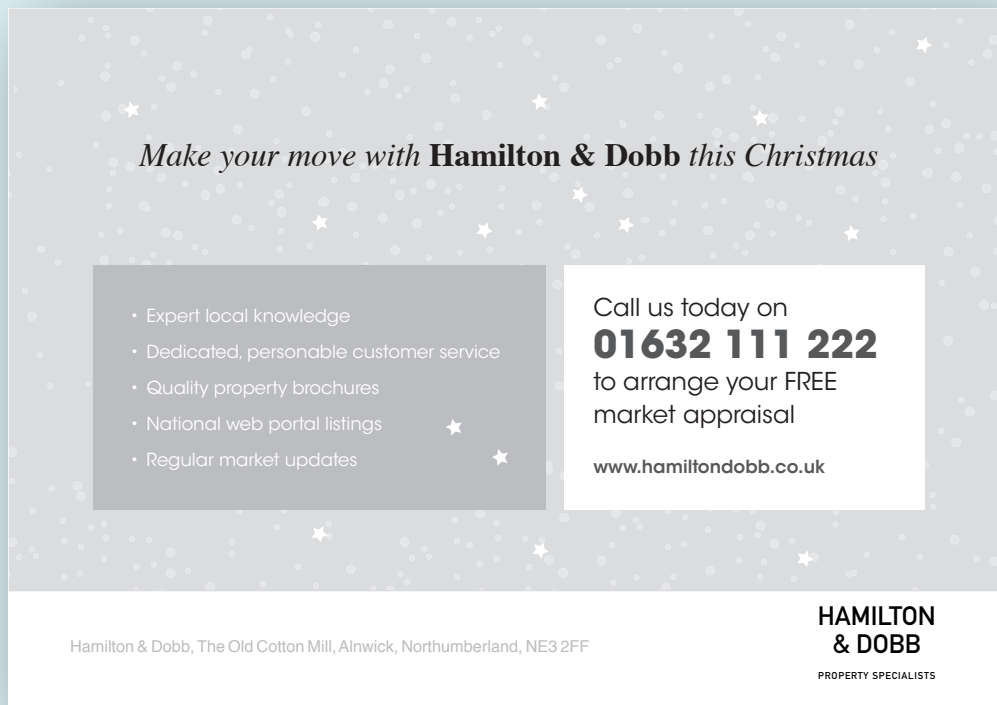
BEST GIFT THIS CHRISTMA (DESIGN 2a)